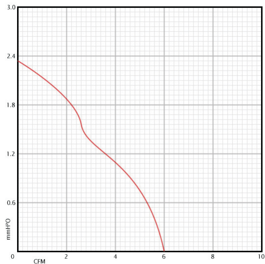
Pressure curve for IXP-13-14